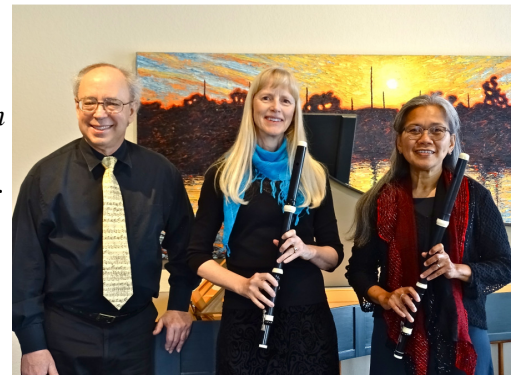
Trio à Due Flauti